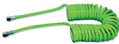
Single Spiral Hose Assemblies